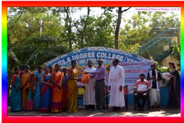
5K Run Winner